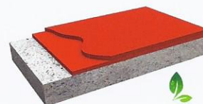
Sparta-Guard PURE™ VOC-Free / Odor-Free