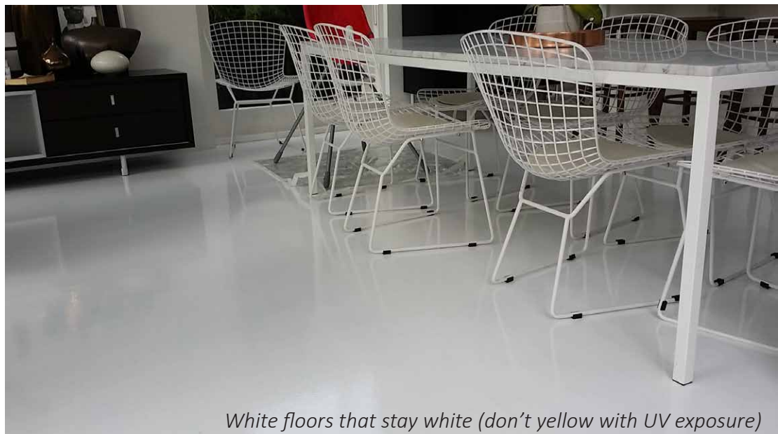
White floors that stay white (don't yellow with UV exposure)

A clear top coat will add to the gloss finish and add a little depth with a slightly glassier finish.